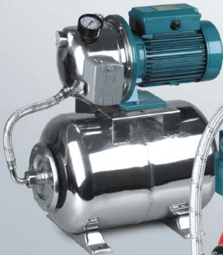
AUTO SFK-370S /550S/750S