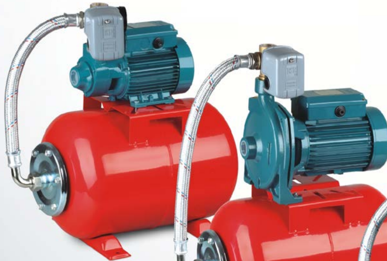
AUTO SFC-370 /550/750

Automatic high pressure groups are coupled with self-priming jet pump. They are very silent and reliable and particularly suitable to increase pressure from a water system, to supply water from wells and in domestic high pressure groups.