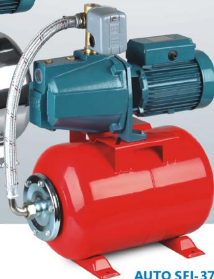
AUTO SFI-370/550 /750/1100/1500