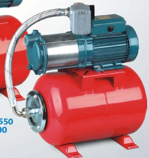
AUTO SFM-250/370/550 /750/920/1100